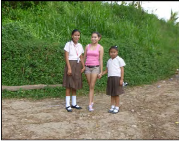
All school children had uniforms and always all smiles