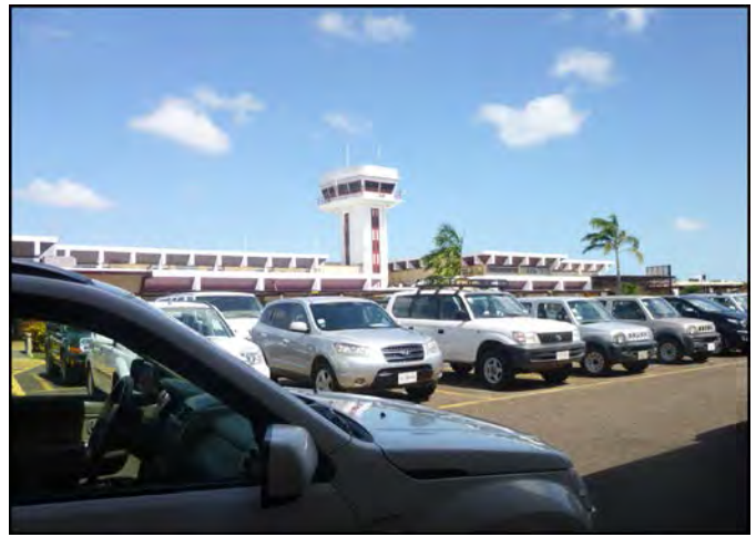
This is the International Airport Belize City from our rental car

I think the interesting consideration we took away from our Belize trip was that it is a small country, business and living environments are negotiable because it is still a small country not overburdened with excessive regulation. The government seems to be open to “discussion” and it is important to negotiation that all participants accomplish satisfied results.